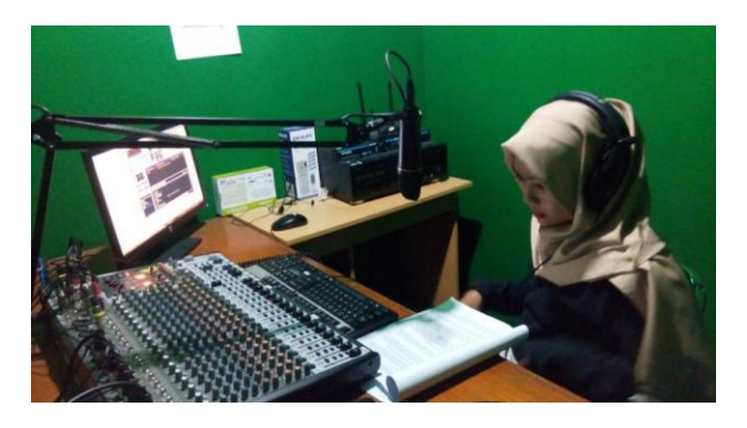
Figure 1. Reading the script

The observation data were collected through field notes and photograph. The data were taken during the Workshop on Radio class. There were 16 meeting for each class and the classes were observed by the lecturers who have experience in radio broadcasting (senior broadcaster) and also English Department lectures. The observation result can be seen as the below: