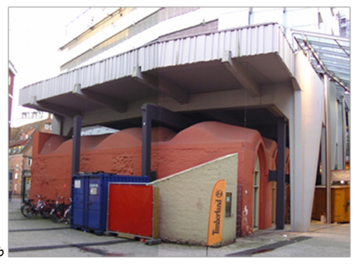
Figure 1. St. Katharinen monastery: a) commemorative silver medal for the centenary of the Gymnasium Illustre's foundation, dating from 1684. The former St. Katharinen monastery is depicted with the cloister and church left of center; the surviving fragment of the eastern claustral wing is indicated; b) The Gerhard-Iverson-Hof today, with the Katharinen-Hochgarage and part of the former eastern claustral wing with the pointed arches of the cloister passage visible on the right.