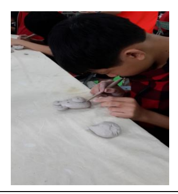
Two of the crafts made by students