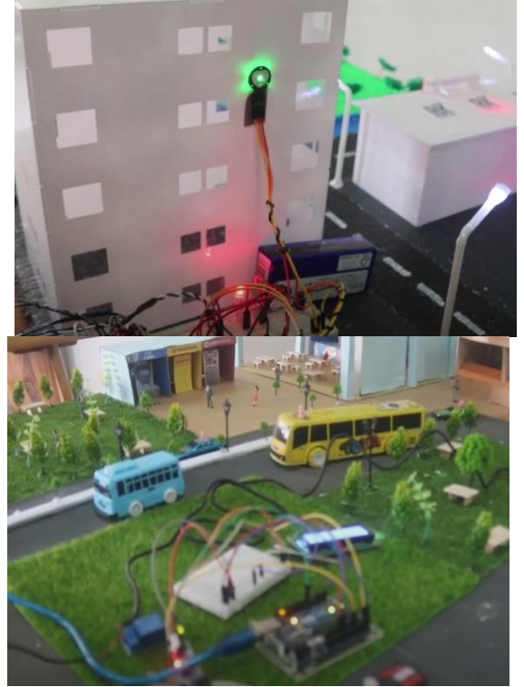
Figure 3. Example Smart City Design

In addition, there is an ultrasonic sensor installed in the parking area to detect the number of parked vehicles. With the ultrasonic sensor, the maximum capacity of the parking area can be determined. If the parking area is already full, it will send a signal to the drivers to find another location to park, thus avoiding congestion. This is one implementation of smart mobility that allows residents to easily move to different locations. Finally, the last sensor used in the prototype design is the servo, which is used as an automatic gate that can be used in housing complexes. The gate will automatically open if the person recognized is allowed, thus increasing the security within the residential complex.