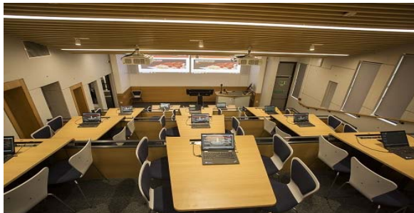
Figure 3. Flexible Design in Classroom (Schoms, 2017)