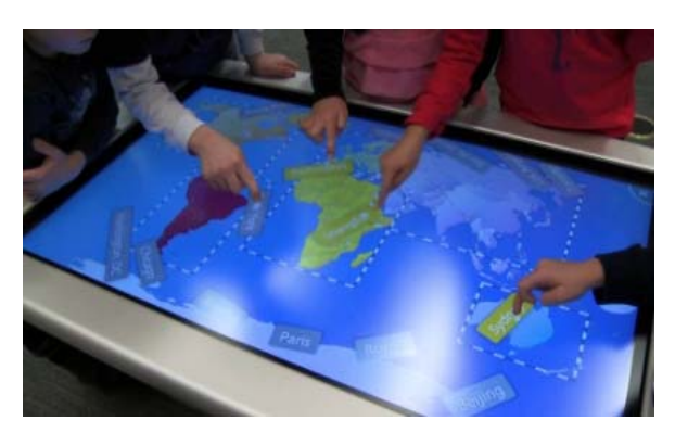
Figure 2. Learning with Interactive Technology (YouTube.com)

With those various digital technologies we have prepared, including technology available in classroom, it is better to design a learning system using flexible tools and contents that can be use individually or integrated, in a proper way, as shown as examples in figure 2 and figure 3.