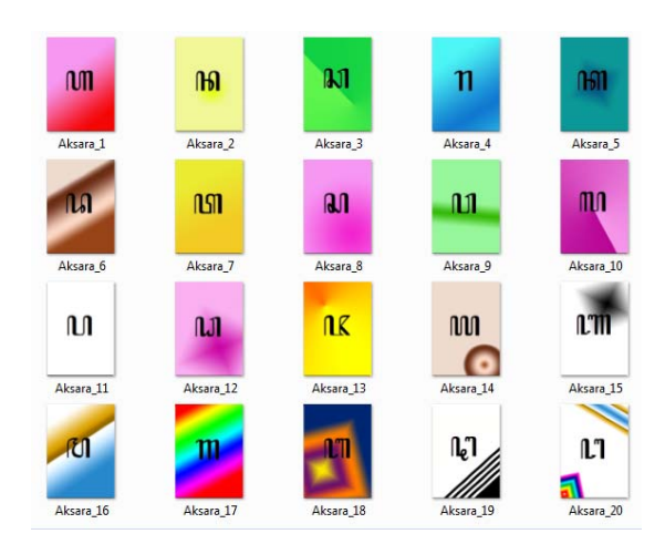
Fig. 4.3 Sprites used at "Memory Match" mode

The picture above is the characters and logos of "Belajar Hanacaraka". The characters wear traditional Javanese clothes complete with blangkon. The character is made to fit the theme of the game related to Javanese tradition.