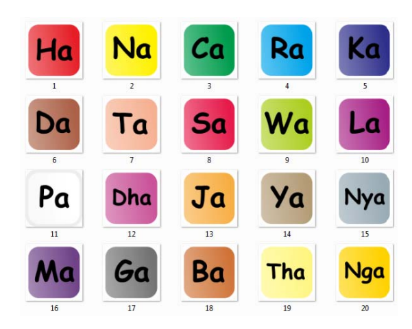
Fig. 4.4 Sprites used in the last mode

The picture above is the sprites of Javanese script used in "Memory Match" and "Tangkap Air" mode.