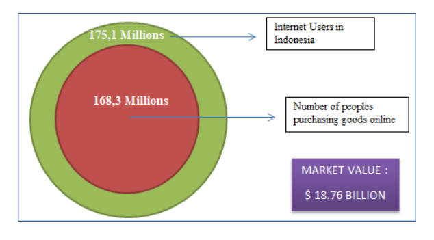
Figure 2. Data of Internet users and number of people purchasing goods online in 2019

This data could be a good opportunity for owners of the companies to make some strategies, because one of the activities that are often be done by using the internet is online transaction activities that can be done in several existing marketplaces.