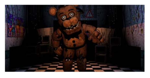
Fig 4. The action of game cloning (First) to the original game (Second

Law enforcement should be present to fight against the video game cloning developers who take advantages of other video games without legal or ethical considerations. However, law is unlikely to provide adequate