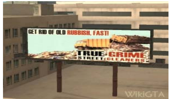
Fig 1. True Crime mocking in GTA San Andreas In their games, game cloners usually put credit to the original one, like in Cameo or give a reference about the game. It differs from the game cloning developers who just want to take quick advantages of famous video games without making any significant changes.

cloning remains potential to damage the market and make the original one disappear from the scene of game industry. The critical game cloning developers do not only carbon copy the original, but they revamp and improve the flaws of the original. Therefore, their video games are not just carbon copies, though the original one is the basis of cloning.