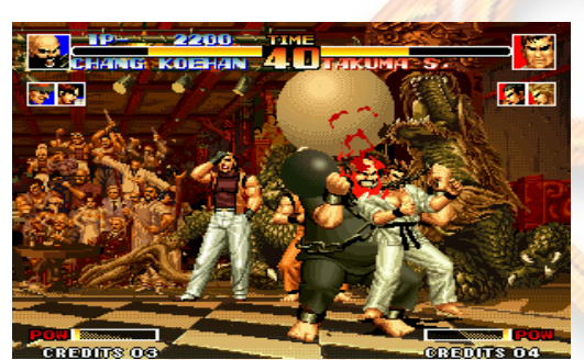
Fig 3. King Of Fighters 94 and Street Fighter II

Gameplay is a system or the main factor in producing a video game. With many video game varieties, it cannot be denied that the varieties are obviously derived from video game cloning, for instances, Saints Row, King of Fighters, Pro Evolution Soccer, and many more. These video games are the imitations of their original versions, yet with some changes and innovations, they are able to stay away from the stigma as cloning games. In fact, they are as good as and even much better than the original versions. Originality is required in gameplay so that the customer can identify the difference between one game with the other. In addition to originality, creativity is also paramount in order to make a gameplay fun, user-friendly, and unique. The standard