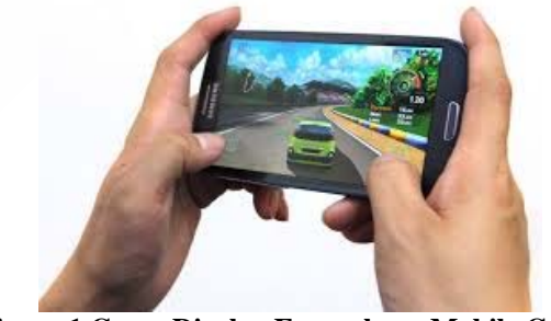
Figure 1 Game Display Example on Mobile Game

Figure 1 shows that actually the appearance of mobile phone game is as good as game on PC or other devices.