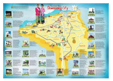
Figure 4.10 Semarang tourism map brochure

The game that is designed as a tourism promotional media of Semarang City and Semarang Regency will display a map of the tour from the city of Semarang and Semarang regency. The purpose of the tourism map is to display a map to transform the existing promotional media that is in the form of a brochure containing the map view of tourism tour to become game technology, so that tourists will be more easily and more fun in getting information about the location of the tourism object in Semarang city and Semarang regency.