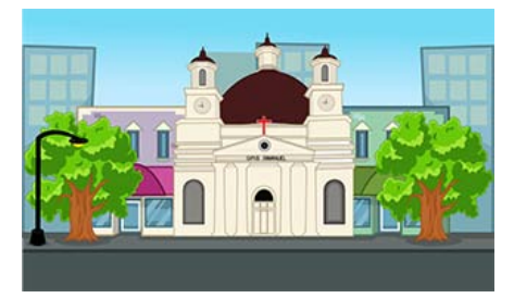
Figure 4.14 Background of Semarang tourism Belnduk Church that will be used in the game