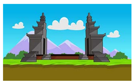
Figure 4.17 Background of Semarang regency tourism Gedong Songo Temple that will be used in the game