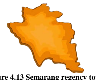
Figure 4.13 Semarang regency tourism map display in-game