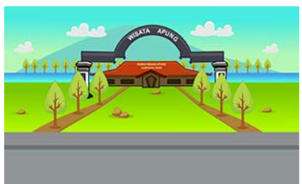
Figure 4.18 Background of Semarang regency tourism Kampoeng Rawa that will be used in the game