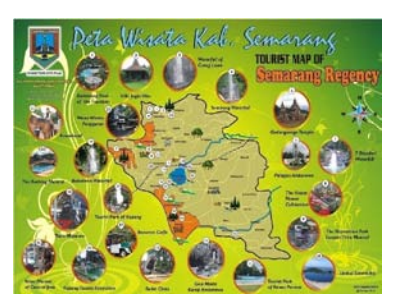
Figure 4.12 Semarang regency tourism map brochure