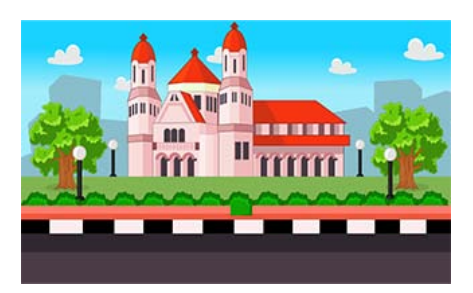
Figure 4.13 Background of Semarang tourism Lawang Sewu that will be used in the game