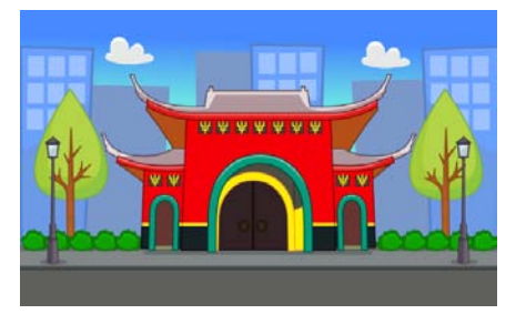
Figure 4.12 Background of Semarang tourism Klentheng Sam Poo Kong that will be used in the game