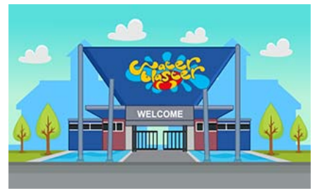
Figure 4.11 Background of Semarang tourism Water Blaster that will be used in the game