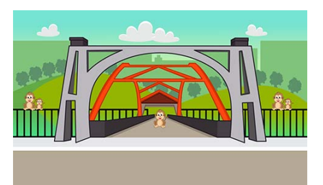
Figure 4.10 Background of Semarang tourism Goa Kreo that will be used in the game

The background in the game is about the introduction of tourism in Semarang city and Semarang regency. It will display the view or one of the buildings of the tourist attractions. For example, Sam Poo Kong represents one of the tourist attractions, while Rawa Pening represents the natural scenery.