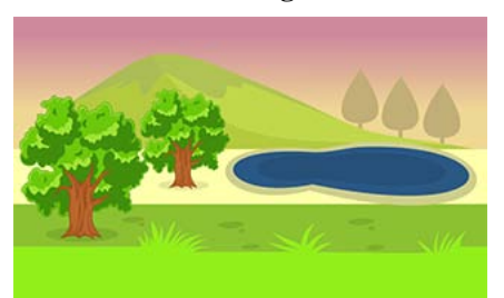
Figure 4.16 Background of Semarang regency tourism Umbul Sidomukti that will be used in the game