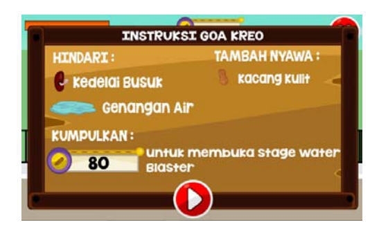
Figure 4.7 Display of "DORANG (Dolan Semarang)" game missions

"DORANG (Dolan Semarang)" game every stage is made to inroduce and promote the attractions of Semarang municipality and Semarang regency to tourists or wider community. This game consists of 10 stages and it contains different attractions, 5 stages consists of a stage attraction in Semarang municipality and 5 stage consists of a stage attraction Semarang regency. Each stage has similar background, attraction, asset, and the number coins collected are different in each stage.