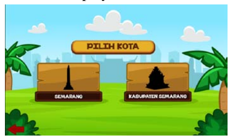
Figure 4.4 Menu select city in "DORANG (Dolan Semarang)" game

Select city menu consist of 3 buttons namely Semarang municipality button, Semarang regency button, and back button. In this menu player can choose the city that will be played.