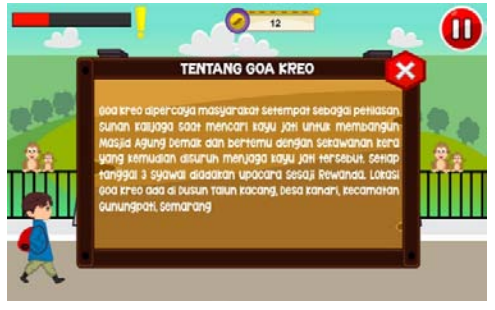
Figure 4.11 Display of attractions "DORANG (Dolan Semarang)" game information