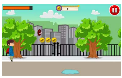
Figure 4.9 In game "DORANG (Dolan Semarang)" display