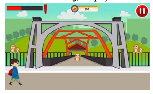
Figure 4.10 Display of attractions "DORANG (Dolan Semarang)" game