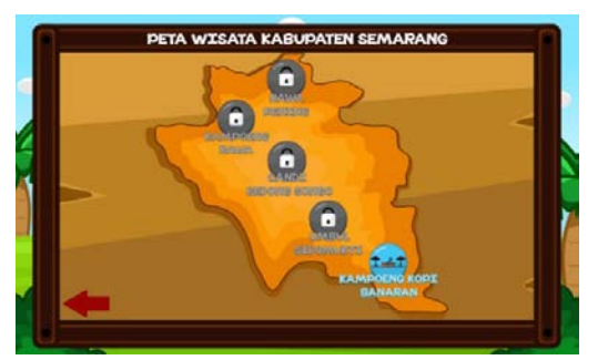
Figure 4.6 tourism map menu of Semarang regency in "DORANG (Dolan Semarang)" game