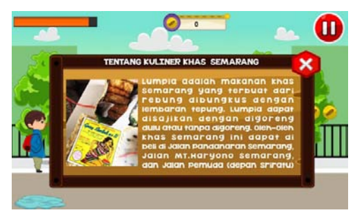
Figure 4.8 Display of culinary "DORANG (Dolan Semarang)" game information