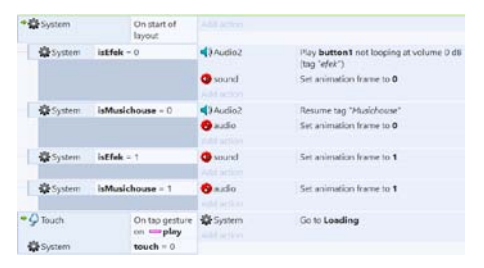
Figure 4.12 Example

In Figure 4.12 is one example of the program main menu, such a program to the start button there is a condition of touch, on tap gesture on play that has a meaning if the start button is clicked then the player will enter main menu loading for waiting game begins.