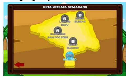
Figure 4.5 Menu of tourism map of Semarang municipality in "DORANG (Dolan Semarang)" game

In this menu there are 5 buttons of the optional attractions in Semarang municipality, 1 key stage open end and 4 key stage closed, so is the menu at Semarang regency.