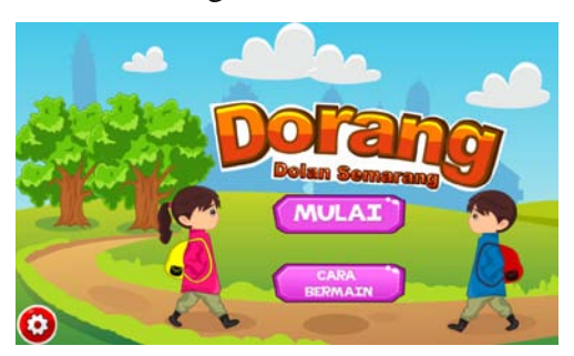
Figure 4.2 Main menu in "DORANG (Dolan Semarang)" game

Game "DORANG (Dolan Semarang)" main menu consists of the start menu options, how to play, and setting. After selecting start button then the player will be directed to next menu, if choosing how to play button then the player will see the steps in to play this game, and if selecting setting button then the player can set up active or not active from back sound and sound effect in games.