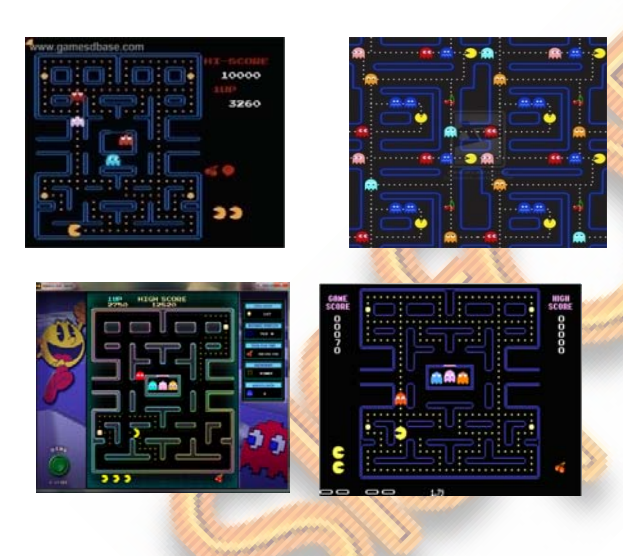
Fig.1 Pacman Game