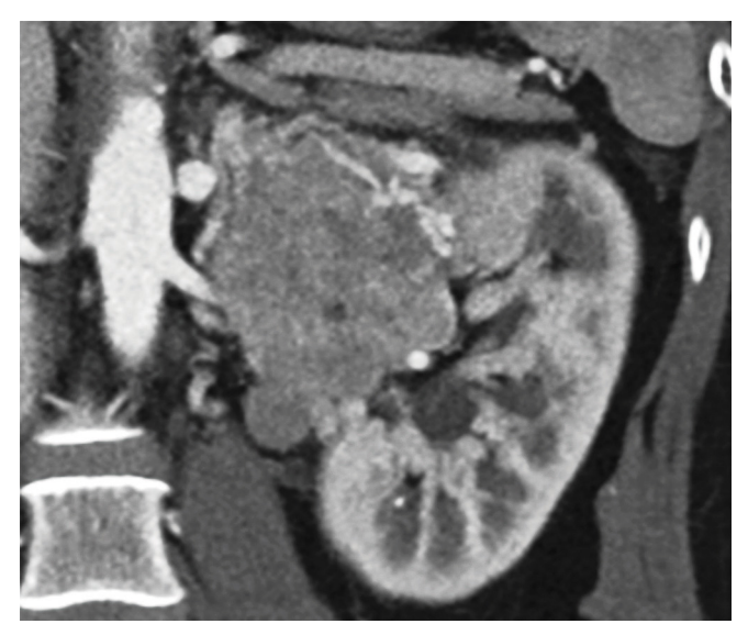
Coronal CT depicting yet another PSA at the origin of a more superior of 2 renal arteries measuring just under 1 cm