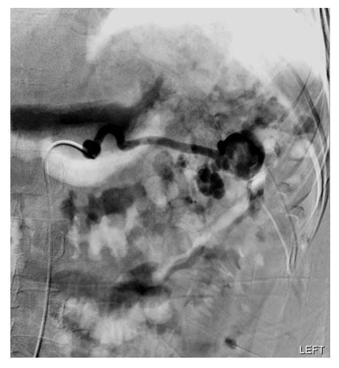
Digital subtraction angiogram of the superior left renal artery confirming a total of 3 PSA, the more proximal originating at the renal artery orifice