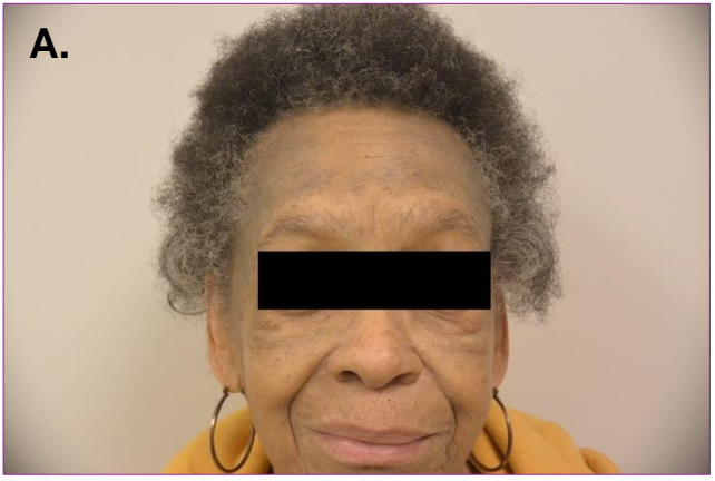
Figure 1. Clinical examination showed ill-defined, slate-grey hyperp igmentation of (A) forehead, (B) temples, (C) and upper back.