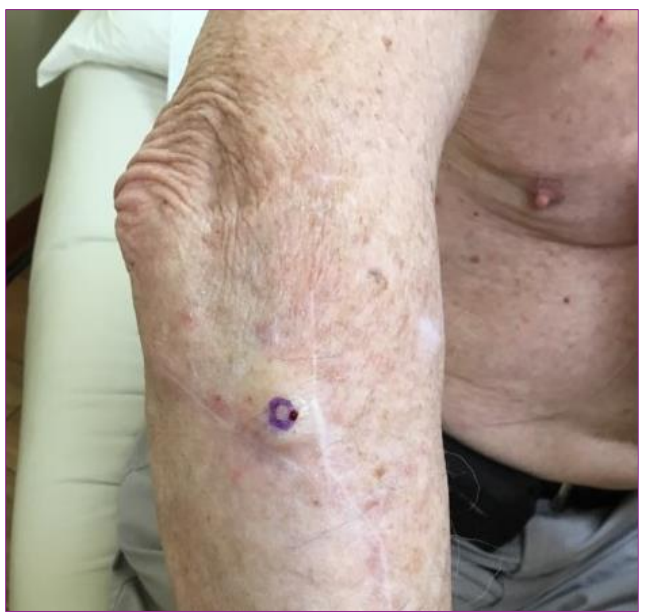
Figure 1. Clinical presentation: A flesh-colored nodule on the right dorsal forearm adjacent to the site of previous melanoma excision

When the third locally metastatic melanoma developed on his right forearm, he again underwent excision of this lesion. At this time, a PET/CT scan demonstrated an enlarged 1.6 cm right sided pelvic lymph node, although CT-guided FNA of the right pelvic lymph node was nonspecific. A repeat core needle biopsy of the lymph node 2 months later showed no evidence of malignancy. However, another PET-CT scan 6 months later showed a metabolically