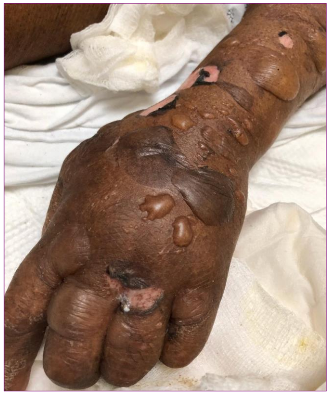
Figure 1. Bullous Pemphigoid. Clinical presentation of tense and flaccid bullae with erosions on left upper extremity