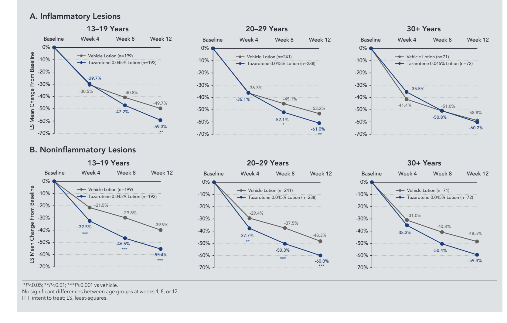
FIGURE 2. Acne Improvements in Females Treated with Tazarotene 0.045% Lotion