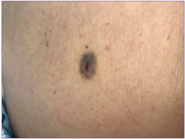
Figure 1. 2cm targetoid vascular lesion on right flank

unremarkable. A 5mm punch biopsy of the lesion was performed.