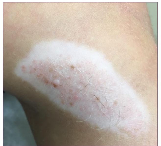
Figure 1. A pink and brown plaque on the left medial knee with surrounding and central depigmentation and poliosis

medial knee with residual pink and brown papules and macules with poliosis (Figure 1). Dermoscopy of the lesion (Figure 2) failed to identify any structures consistent with melanoma.