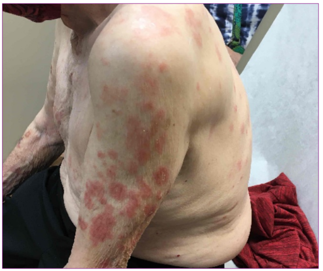
Figure 1. Terbinafine-induced subacute cutaneous lupus erythematosus. Scattered pink to red polycyclic annular plaques, some with overlying scale and with heme crust, on the bilateral arms and trunk. There were also lesions on the bilateral lower legs.

annular plaques on his trunk and bilateral arms and lower legs (Fig. 1), some with overlying scale and with heme crust, but there was no ocular or oral mucosal involvement.