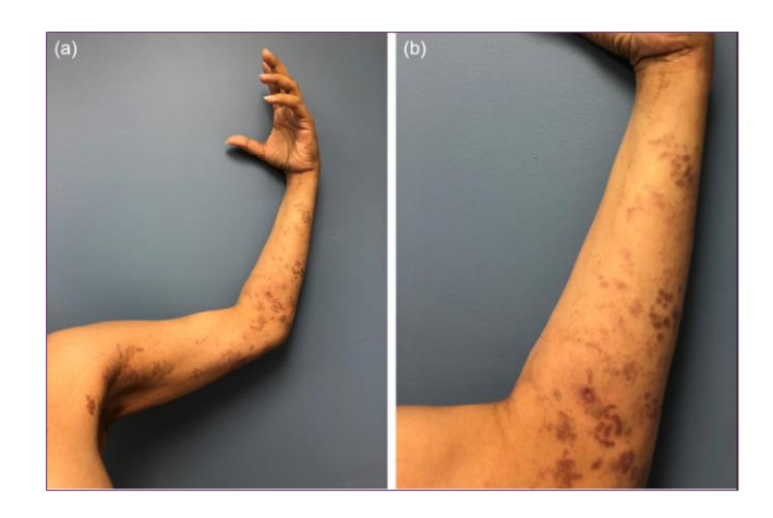
Figure 1. Violaceous papules in a dermatomal distribution

Histopathology showed dermatitis with hyperkeratosis, acanthosis. prominent lymphocytegranular laver. and inflammatory predominant. band-like infiltrate obscuring the dermal-epidermal junction (Figure 2A, B). Sawtoothing of the rete ridges and occasional dyskeratotic keratinocytes within the lower third of the epidermis were present. The papillary