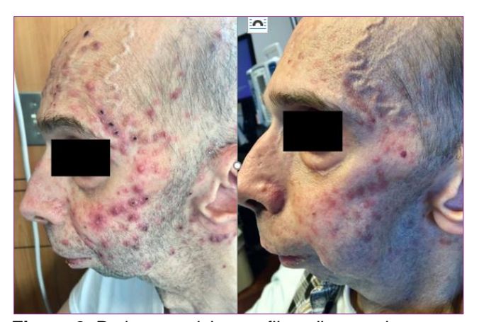
Figure 2. Patient receiving carfilzomib, one dose every two weeks, then daratumumab for multiple myeloma A) Two weeks after starting daratumumab. Erythematous, folliculocentric papules, deep nodules, and pustules on the bilateral temples, cheeks, ears, scalp, forehead, and posterior neck B) Significant resolution seen two weeks after starting ivermectin for demodicosis.

A man in his 50s receiving proteasome inhibitor carfilzomib 54mg/m² one dose every two weeks for multiple myeloma presented with a new onset facial rash consisting of 2-4 mm pink follicular papules on the face, neck, and scalp. The patient endorsed temporary improvement with 1g doses of methylprednisolone with every carfilzomib infusion. He initiated treatment with clobetasol 0.05% cream twice daily for 2 weeks with some improvement. Two months later, approximately two weeks after switching therapy to daratumumab, he was hospitalized for cancer-related complications and worsening pruritic facial eruption. His revealed physical exam excoriated. erythematous, folliculocentric papules, deep nodules, and pustules on the bilateral temples, cheeks, ears, scalp, forehead, and posterior neck (Figure 2a). Mineral scraping of pustules revealed no organisms. Punch suppurative vagoid showed deep dermal neutrophilic inflammation with infiltrate, and Demodex mites (Fig 3). He received 15mg of oral ivermectin (two doses, 1 week apart) for the treatment of demodicosis, achieving complete resolution at two-week follow-up (Fig 2b).