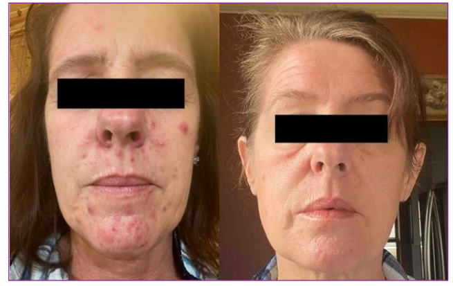
Figure 1 . Patient receiving vemurafenib and trametinib daily for anaplastic astrocytoma A) One week after starting targeted therapy. Pink papules and pinpoint pustules noted on the forehead, nose, cheeks, upper lip and chin B) Remarkable improvement of cutaneous events 10 days after starting ivermectin for demodicosis.

A man in his 50s receiving proteasome inhibitor carfilzomib 54mg/m² one dose every two weeks for multiple myeloma presented with a new onset facial rash consisting of 2-4 mm pink follicular papules on the face, neck, and scalp. The patient endorsed temporary improvement with 1g doses of methylprednisolone with every carfilzomib infusion. He initiated treatment with clobetasol 0.05% cream twice daily for 2 weeks with some improvement. Two months later, approximately two weeks after switching therapy to daratumumab, he was hospitalized for cancer-related complications and worsening pruritic facial eruption. His revealed physical exam excoriated. erythematous, folliculocentric papules, deep nodules, and pustules on the bilateral temples, cheeks, ears, scalp, forehead, and posterior neck (Figure 2a). Mineral scraping of pustules revealed no organisms. Punch suppurative vagoid showed deep dermal neutrophilic inflammation with infiltrate, and Demodex mites (Fig 3). He received 15mg of oral ivermectin (two doses, 1 week apart) for the treatment of demodicosis, achieving complete resolution at two-week follow-up (Fig 2b).