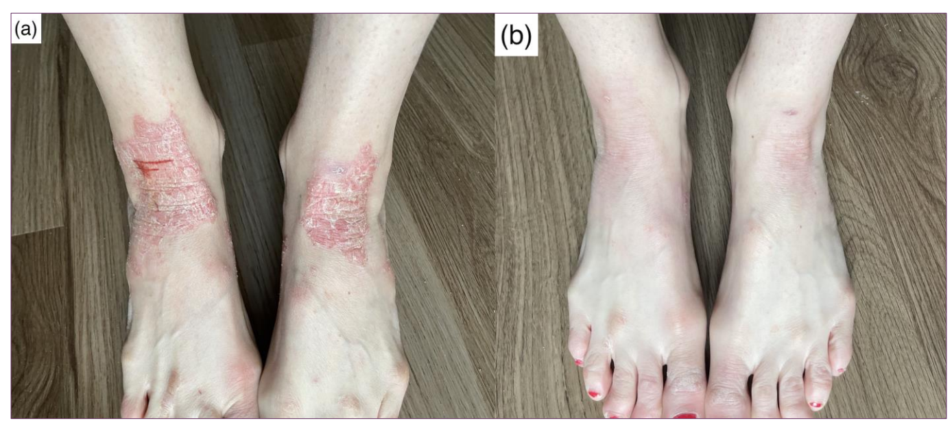
Figure 1 . A) On the bilateral dorsal feet there are large pink erythematous plaques with abundant silvery scale B) After 8 weeks on apremilast, the patient has almost complete resolution with only faintly pink patches.