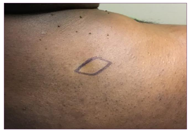
Figure 1. A) Initial presentation of a cystic nodule

clinic with a complaint of a cyst located on his right shoulder for 2 years (Figure 1A).