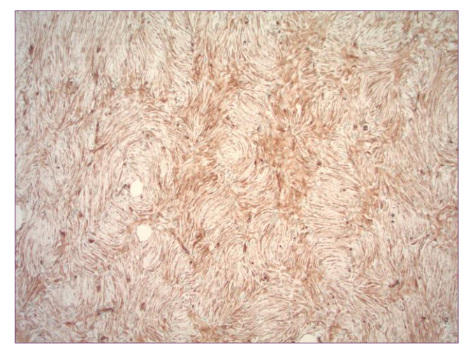
Figure 3. CD34 staining after initial resection of tumor

The neoplasm was extremely cellular with little intervening collagen. The cells were thin and filiform in shape, with slender, wavy nuclei, and in foci showed prominent whirling. The specimen stained positive for CD34 and negative for SOX-10, confirming the diagnosis of DFSP (Figure 3).