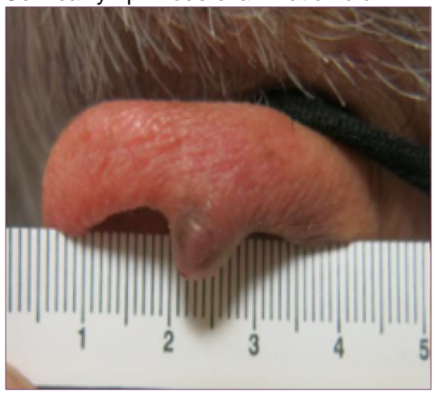
Figure 1. Physical examination revealed thepresence of a pink, purple, and brown dome-shaped papule approximately 0.8 cm in diameter on the right superior helix of the ear

Physical examination revealed a 0.8 cm pink, purple, and brown dome-shaped papule on the right superior helix of the ear (Figure 1). The lesion was tender to palpitation and drainage was observed. Cervical lymph node examination did