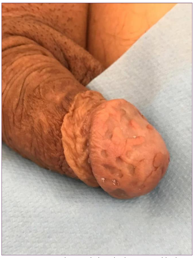
Figure 1: Penile pyoderma gangrenosum: erosive, and sharply demarcated lesions on the glans penis

<sup>1</sup>Ibn Sina University Hospital Dermatology Department, Mohammed V University, Rabat, Morocco