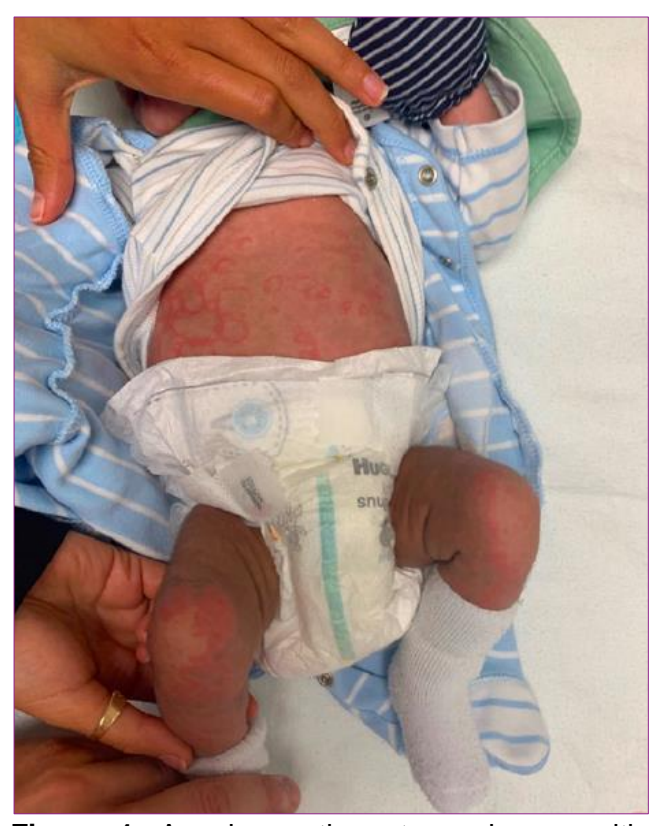
Figure 1. Annular erythematous plaques with elevated borders on the abdomen.

in shape and distribution. In addition to the lesions on the trunk and extremities, multiple pustules over an eczematous base appeared on the bilateral cheeks and forehead. No lesions were noted on volar or mucosal surfaces. Per the mother, the patient did not appear irritable.