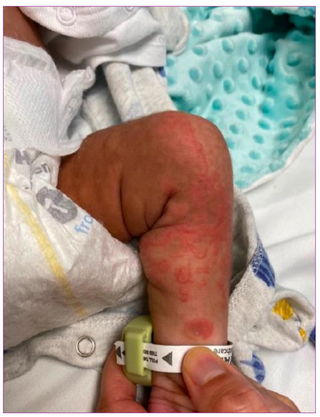
Figure 2. Annular erythematous plaques with elevated borders on the left lower extremity.

erythema of infancy (AEI), neonatal eosinophilic pustulosis, erythema annularis centrifugum (EAC), and neonatal lupus. A 3-0 punch biopsy was performed on the right lower extremity. Histology showed mild without parakeratosis spongiosis and eosinophils interstitially and perivascularly in the dermis (Figure 3a-c). PAS stain was negative for fungi. There was no evidence of vasculitis or other significant inflammatory histological infiltrate. The differential included hypersensitivity reaction and allergic reaction.