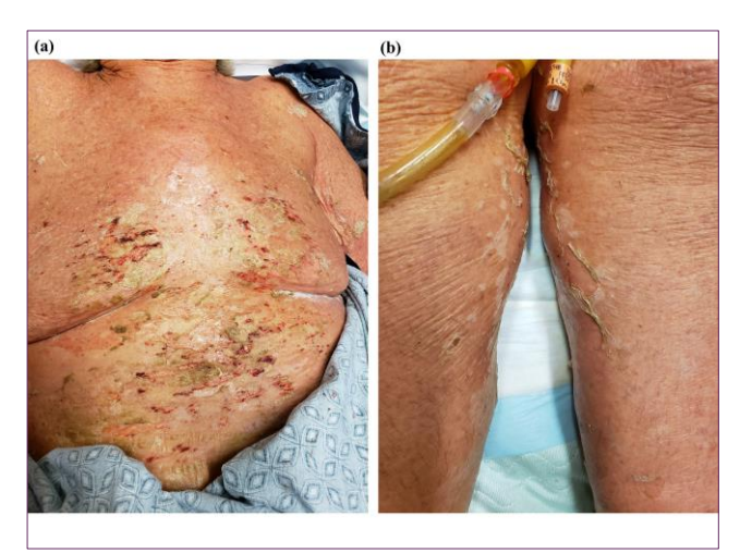
Figure 1. Patient's initial presentation of erythroderma with thick scaly plaques and superficial desquamation A) with pinpoint pustules coalescing into lakes of pus in the skin folds B)

On arrival, she was afebrile and hemodynamically stable. Exam revealed erythroderma with light-yellow, thick scaly plaques on the trunk and extremities with superficial desquamation and superficial pustules coalescing into lakes of pus in the right groin fold (Figure 1). Oral and ocular mucosa were clear. There were no new medications or dose changes prior to outside hospital admission.