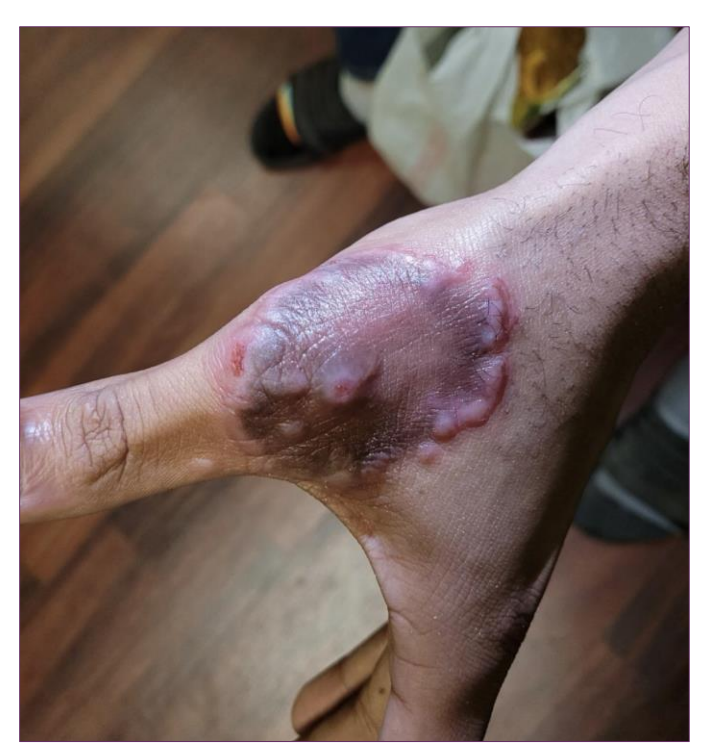
Figure 1 : Annular, friable violaceous plaque with surrounding erythematous raised border with solitary nodules containing pinpoint petechiae

A 33-year-old Black homosexual male presented with a plaque that appeared four months after he injured his hand on a metal railing under his car seat. A 3.0 x 3.5 cm well-defined, annular friable violaceous plaque with surrounding erythematous raised border with solitary nodules containing pinpoint petechiae was seen on physical examination