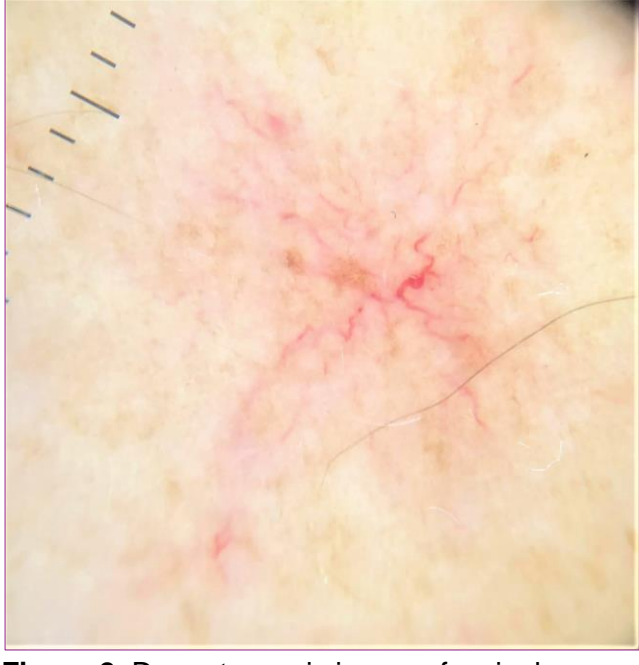
Figure 2. Dermatoscopic image of a single telangiectasia on the upper back