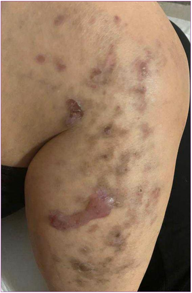
Figure 1. Bullae localized to the right mid-lateral leg.

The disease course is more benign than generalized BP due to its responsiveness to topical steroids, though LBP may also progress to generalized disease.<sup>3,4</sup>