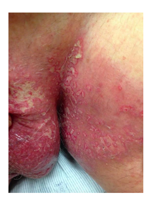
FIGURE 2: Macerated erythematous thin plaques with superimposed crusted punched-out ulcers in the inguinal fold and scrotum.