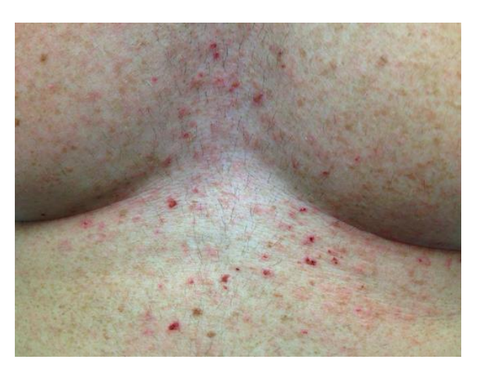
FIGURE 1: Crusted erythematous papules scattered over the central chest.

or oral ulcers and had no known history of HSV infection. The patient experienced significant improvement with oral valacyclovir.