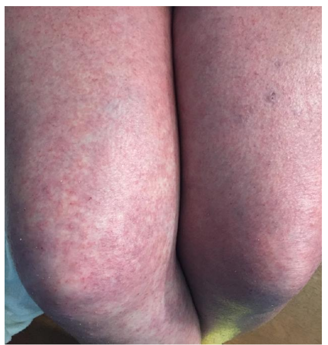
Figure 1. Confluent erythematous papulovesicles and plaques on the bilateral lower extremities.

plaquenil were initiated to treat her active dermatomyositis.