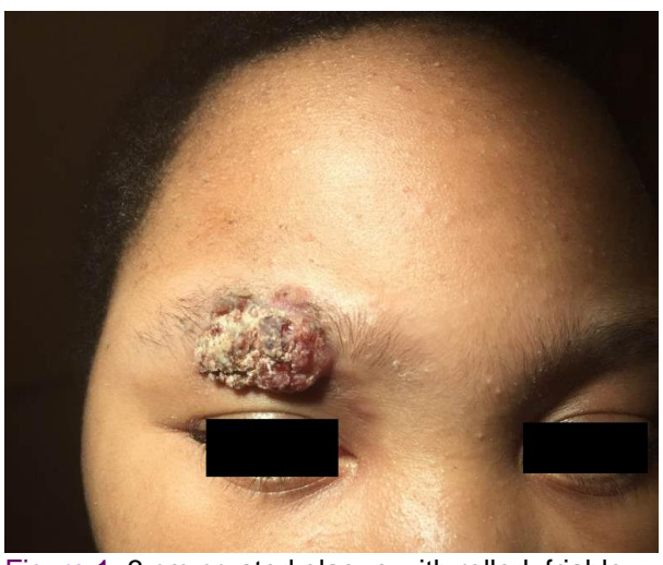
Figure 1. 3 cm crusted plaque with rolled, friable borders over the right eyebrow.

borders was noted of the right eyebrow. Shave biopsy was obtained as well as superficial cultures which returned with plentiful yeast forms and growth of Cryptococcus neoformans , respectively (Figure 2). Serum cryptococcal antigen was negative. The lesion resolved with a course of oral fluconazole.