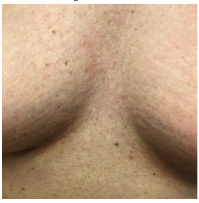
Figure 2: Slight erythema with scattered papules in the lower sternal region.

Based on the clinical and histopathological results of the skin biopsy, the patient was with reticular diagnosed erythematous mucinosis. After clearance bγ ophthalmologist, the patient was started on 200 mg of hydroxychloroguine daily. Appropriate sun protection of the affected area, as well as smoking cessation, were thoroughly discussed with the patient. She denied symptoms of common comorbidities with REM discoid such as lupus erythematosus (DLE), idiopathic thrombocytopenic purpura (ITP), diabetes mellitus, and thyroid disease. She was instructed to follow-up with her primary care physician for further workup of associated conditions age-appropriate and cancer screening.