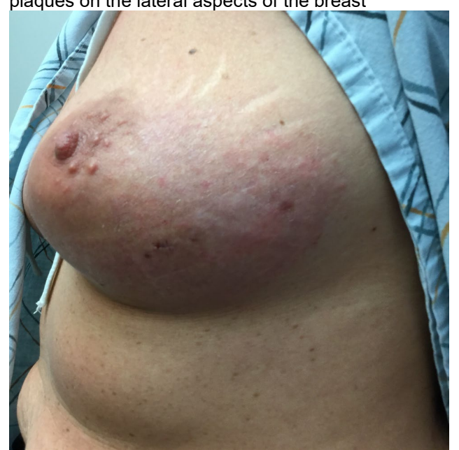
Figure 1: Mildly pruritic, erythematous reticulated plaques on the lateral aspects of the breast

A 4 mm punch biopsy of the left breast showed a superficial to mid perivascular inflammatory cell infiltrate consisted predominantly of lymphocytes (Figure 3a). The collagen fibers within the reticular dermis were widely separated, and an Alcian blue stain showed deposition of increased dermal mucin within these spaces (Figure 3b).