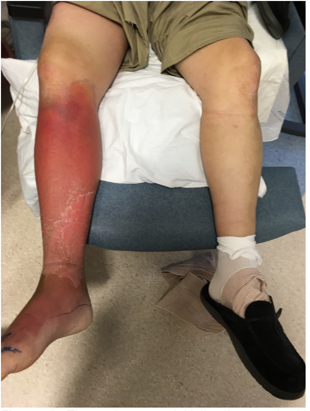
Figure 1: The patient was initially diagnosed with cellulitis but, after inadequate response to broad spectrum antibiotics, a biopsy was performed consistent with pemetrexed induced pseudocellulitis.

The erythema failed to improve despite adequate treatment with broad spectrum antibiotics and the dermatology team was consulted. Exam was notable for bright red blanching erythema of the right lower extremity extending from the dorsal foot to the distal knee (Figure 1). The entire area was warm and tender to light touch. There was also 2+ edema of the lower extremities bilaterally. However, his overall clinical presentation was inconsistent with a poorly-controlled, antibiotic-resistant infection as he was generally well-appearing, afebrile and