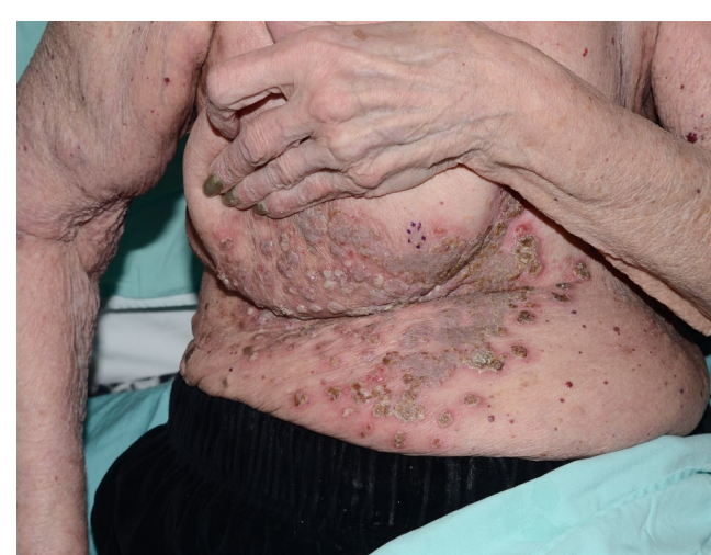
Figure 1: Plaques present in the inframammary fold.

PDV can be difficult to distinguish from pemphigus vegetans, a rare autoimmune bullous disease, since the two disorders share many clinical and histologic features.