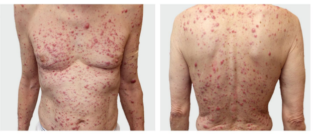
Figure 1: 76 year old male presenting with an eruption of innumerable plum-colored nodules.

Bone marrow biopsy demonstrated hypercellular bone marrow with granulocytic/ megakaryocytic hyperplasia, and dysgranulopoiesis. Peripheral blood smear