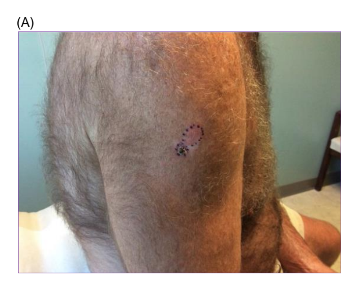
Figure 1. Squamous cell carcinoma in situ on right upper arm of patient (A) before biopsy and (B) two weeks after imiquimod treatment, coinciding with onset of erythema multiforme.