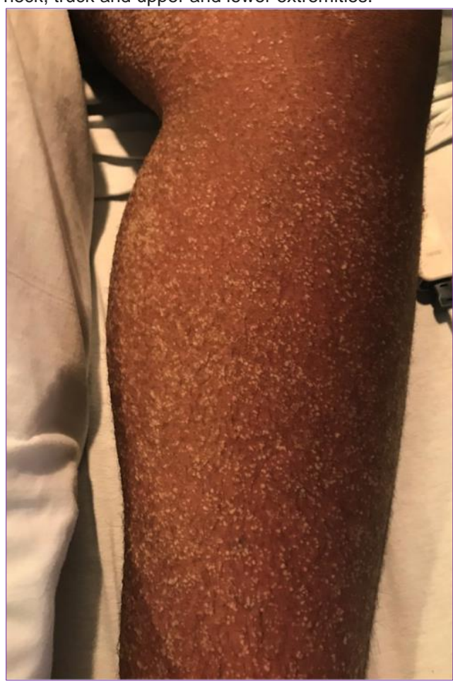
Figure 1. Clinical presentation of left lower extremity on hospital day 1. Physical exam was notable for pinpoint pustules coalescing in some areas into larger pustular bulla on a background of erythema on neck, truck and upper and lower extremities.

Clinical and histologic findings were most consistent with GPP. Cyclosporine 3mg/kg/day was initiated and the patient's lesions began to desquamate the following day. As an outpatient, he was transitioned to acitretin 25mg daily and has been maintained on this for the past 9 months without any recurrence.