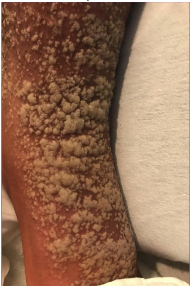
Figure 2. Clinical presentation of left lower extremity on hospital day 2. On day 2, the pustules became more confluent to form pustular lakes on the hands and lower extremities (Figure 2), Note the worsening pustular lesions that have enlarged and become more confluent in addition to pustular lake formation on the left lower extremity.