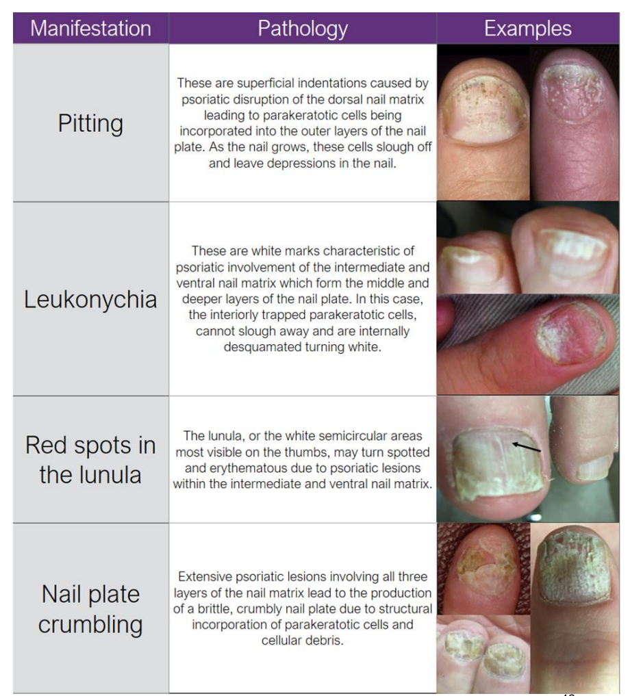
Figure 2. Nail matrix psoriatic manifestations visible on the nail plate 12