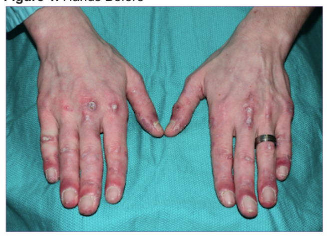
Figure 1. Hands Before

The above histopathologic features in combination with the clinical presentation were deemed compatible with the diagnosis of chilblains lupus. Our patient was advised on proper preventative measures. Treatment was initiated with topical clobetasol 0.05% ointment, low dose Amlodipine 2.5mg daily, Pentoxifylline 400mg three times daily, and Chloroquine 250mg once daily given his prior side effects with hydroxychloroquine. He plans to follow up with our dermatology department for further monitoring.