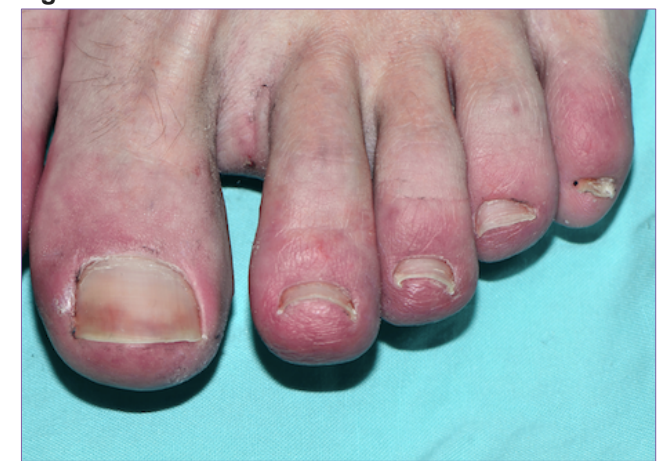
Figure 4. Left Foot After