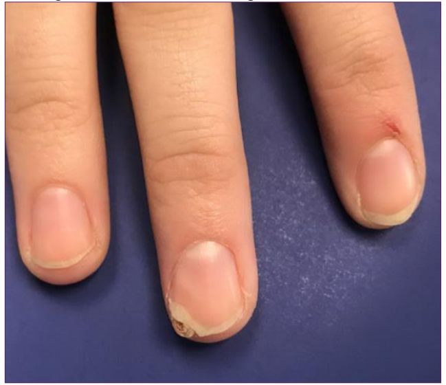
Figure 1. Hyperkeratotic papule in the distal subungual area of the third finger

SAFM is a rare tumor that often involves the nail bed sometimes after trauma, but most patients report no inciting factor.<sup>3,4</sup> Potential complications include nail disfigurement, ulceration, pain, repeated trauma, and infections.<sup>3</sup> However, most SAFM are asymptomatic. It presents as a solitary fleshcolored papule or nodule extending through the dermis with possible extension to underlying subcutaneous tissue, fascia, and periosteum.<sup>3,5</sup> Metastasis has never been reported, however mass effect can cause local bone erosion and lytic lesions. Osseous May 2020 Volume 4 Issue 3