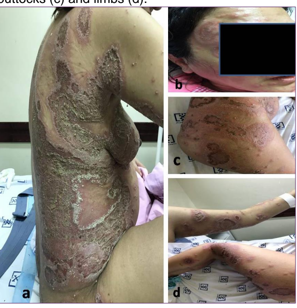
Figure 1. Extensive erythematous, pruritic plaques with peripheral scaling and sterile pustules on the abdomen and back, suggestive of pustular psoriasis of pregnancy (a). Pustular lesions on the face (b), buttocks (c) and limbs (d).

investigations were within normal limits (or negative).