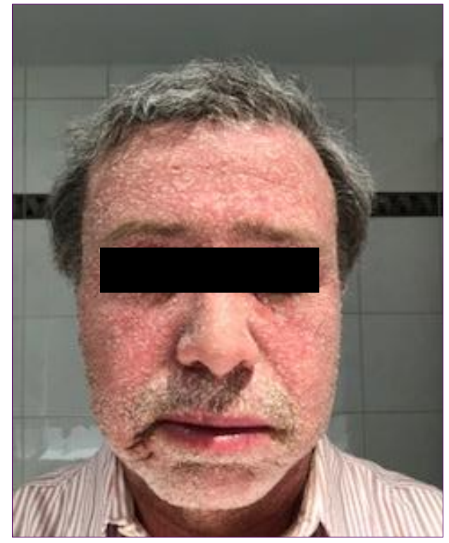
Figure 1B. Patient at 12 weeks of brodalumab treatment.

Figure 1A. Patient at his initial presentation to our clinic.