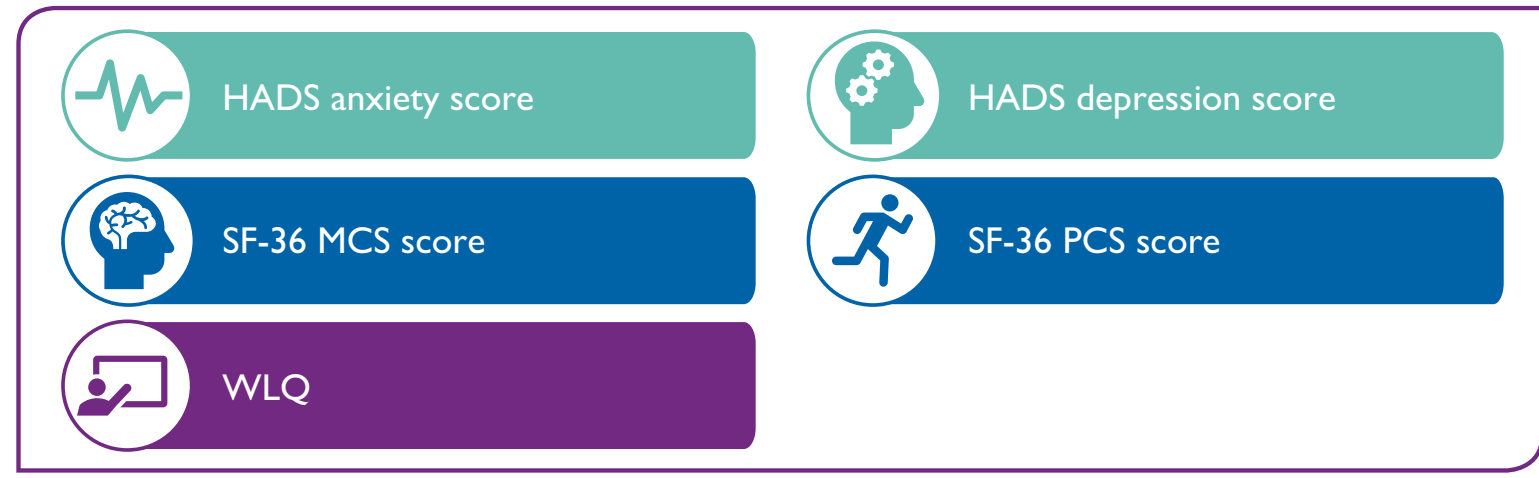
Figure I. Quality of life measures assessed in this post hoc analysis.

HADS, hospital anxiety and depression scale; MCS, mental component summary; PCS, physical component summary; SF-36, Short Form 36 health survey; WLQ, work limitations questionnaire.