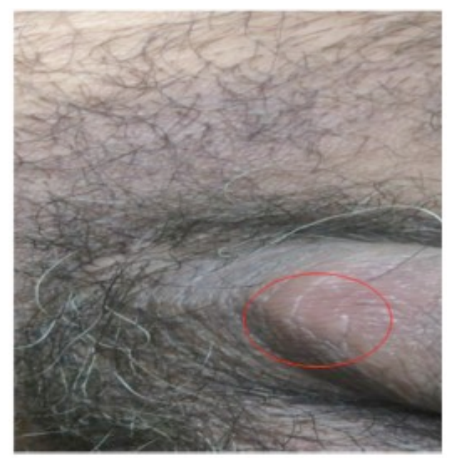
Figure 1: PMD, Case 1. Circled is the palpable cord.