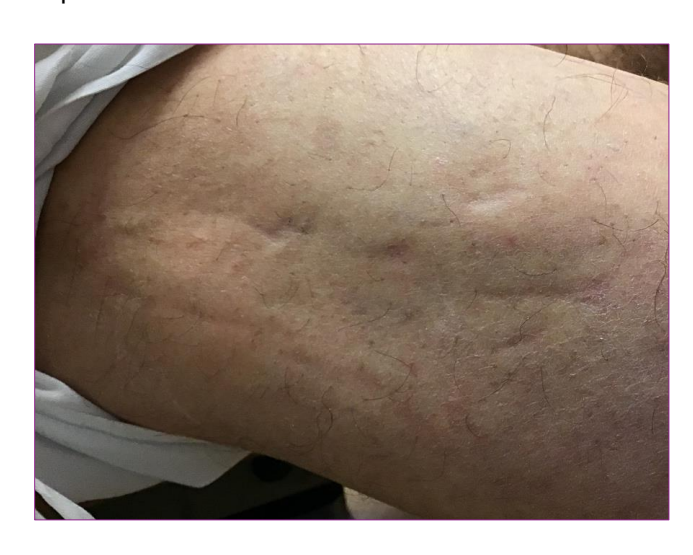
Figure 1. Sclerodermatous cGVHD. The right thigh of the patient with puckered skin and linear depressions.

Histological assessment revealed fascial thickening and extensive dermal sclerosis. There was general loss of the peri-adnexal