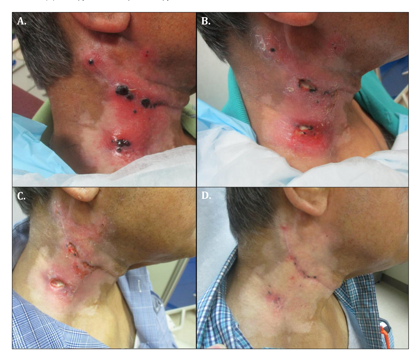
Figure 1. Progression of Cutaneous Melanocytic Lesions over Course of Interleukin Treatment. ( A ) Therapy two weeks into treatment with IL-2; ( B )Therapy five weeks into treatment with IL-2; ( C ) Therapy one week post therapy with IL-2; ( D ) Therapy four weeks post therapy with IL-2.

nivolumab to pembrolizumab and ipilimumab with a goal of increased immunologic response, but did not gain significant benefit. His daily oral hydrocortisone dependency precluded him from other systemic treatments, such as tumor infiltrating lymphocytes (TIL), or clinical trials.