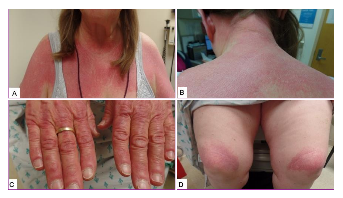
Figure 3. Case 3 Clinical Findings. Dermatological examination of Case 3 revealed ( A ) erythematous patches covering the forehead, periocular area, cheeks, chest and arms, abdomen, and ( B ) back. There were also ( C ) erythematous papules on the dorsal hands in addition to ragged cuticles. ( D ) Both knees also had erythematous to violaceous patches bilaterally.

4/5 patients with elevated CK. Among the Asian cohorts, the Fujimoto study found 5/7 patients with elevated CK. <sup>3</sup>Within our small cohort. CK and aldolase levels were initially all within normal limits, however, CK levels became elevated in Cases 1 and 2. Case 3 did develop severe subjective weakness despite normal CK. Furthermore, two of our three patients were ANA positive, with one demonstrating patient anti-histone antibodies, and another with anti-ssDNA antibodies, findings not described in the literature with respect to this specific subset of DM patients.