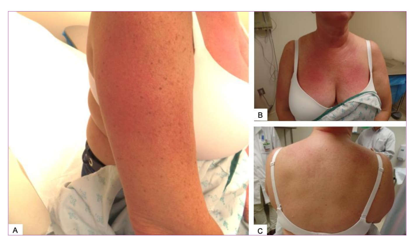
Figure 1. Case 1 Clinical Findings. Cutaneous examination of Case 1 revealed ( A ) confluent erythematous patches involving the upper arms bilaterally, ( B ) the upper chest, ( C ) and the upper back. The patient also had erythematous and edematous plaques involving the bilateral upper eyelids, and erythematous macules over the dorsal hands.

trunk, and upper extremities (Figure 1).At presentation, patient did not report any myalgias, weakness, dysphagia, dyspnea, or weight loss. Over the next several months. patient developed weakness and dysphagia, which responded to a combination of monthly intravenous immune globulin (IVIg), mycophenolate mofetil (MMF), and prednisone. However, her cutaneous disease did not improve with above treatments in addition or to intramuscular and topical corticosteroids and worsened with hydroxychloroguine, which was then discontinued.